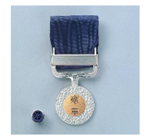
Medal with Purple Ribbon, Medal with Blue Ribbon, Medal with Dark Blue Ribbon