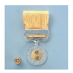
Medal with Red Ribbon, Medal with Green Ribbon, Medal with Yellow Ribbon